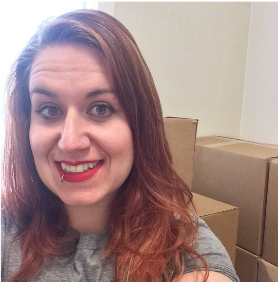
Get Moving!

We hope you are enjoying the latest news and information from The Faculty of Graduate Studies. You may unsubscribe from further emails by replying to this email with 'unsubscribe' in the subject line. If you have any questions, please contact us at 515 Portage Avenue, Winnipeg, MB R3B 2E9 or 204.786.9797.